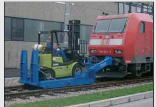
Shunting operation on open tracks