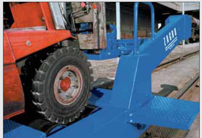
Propulsion rollers for power transmission