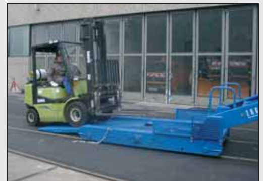
Lower the ramps to drive on the platform