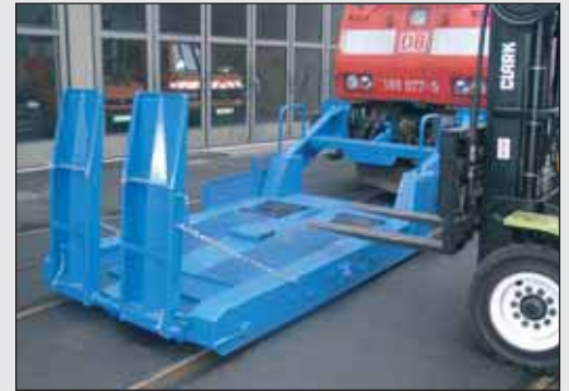
Use the forklift truck to put it on the rails

The forklift truck driver will operate the unit. The forklift truck is employed as the driving element. The power transmission results from the driving gears of the forklift truck on four propulsion rollers – similar to a brake test stand. Four rubber wheels are then driven by chains. Due to the gear ratio of 1:5 and the high coefficient of friction between rubber wheels and steel rails, high tractive force is reached. By the separate arrangement of the driving wheels and rollers for each side, the differential gear of the forklift truck will be used for driving in turns and over switches. Use the forklift truck to take the platform to the place of action and put it on the rails. Lower the ramps, drive the forklift truck onto the railcar mover, pull up the ramps and secure the forklift truck by using the fork brackets. Couple the unit with the wagons to be moved. Now the railcar mover is ready for action. You can safely move and brake complete sets of wagons.